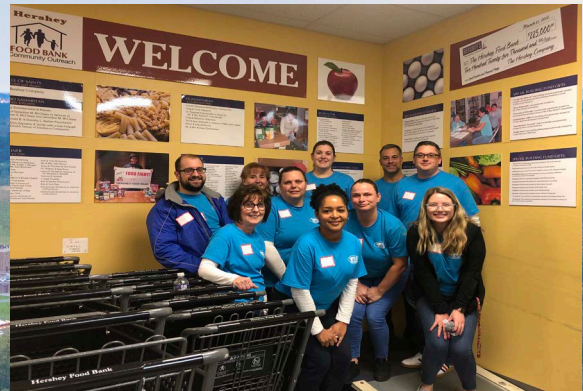
Feed the Need - Hershey Food Bank