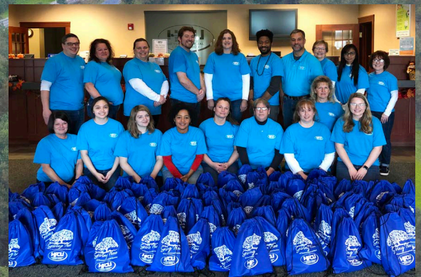
Donations for Veterans